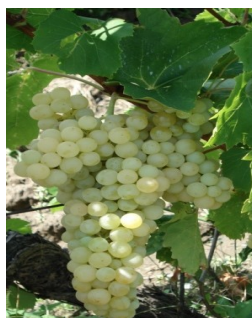
Fig. 1. Perlette 10 St clone

The variety falls in the group with great growth vigour. It has a medium tolerance to low temperatures during winter at mildew. It matures in phase IV.